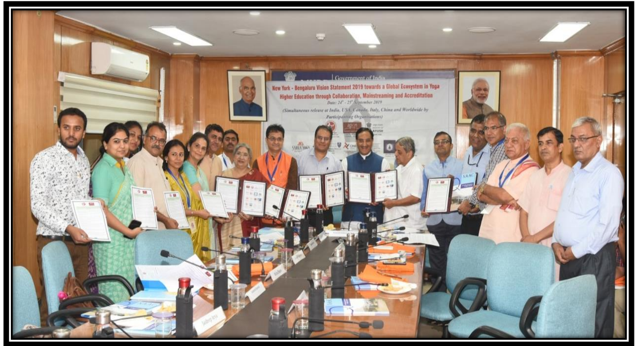
Release of New York-Bengaluru Vision Statement by Shri Shripad Yesso Naik ji, Hon'ble Minister of AYUSH in presence of Members of Indian Yoga Associations, AYUSH Officials and NAAC Experts.